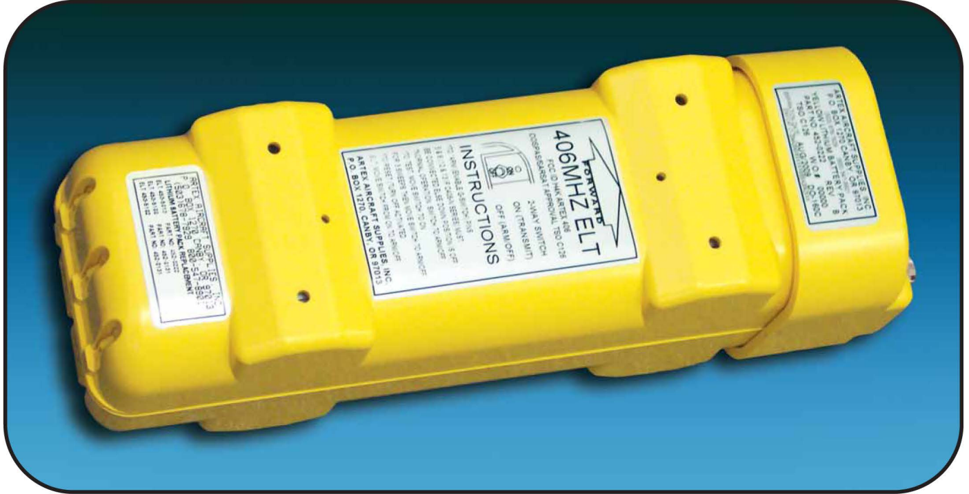
G406-4 Transmitter Installation Configuration