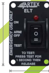
8102 ARTEX STANDARD 2-WIRE REMOTE SWITCH